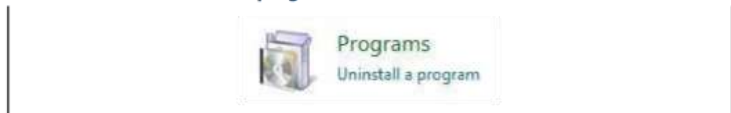
Figure 6. Control Panel – Uninstall a program